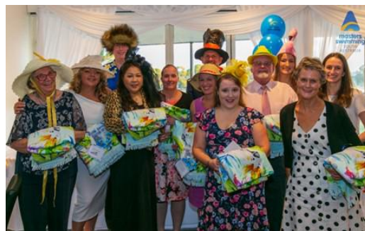
Annual Branch Presentation