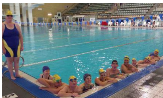
Superfins (WA) Age Group Trophy – 72-119 years

Thank you to the Technical Officials & General volunteers who offered their time and worked tirelessly over the five days. Without the willing help of these people an event like this would never happen. Whilst the total number of entries was a little disappointing, the Organising Committee and MSSA was pleased with the event and so were the swimmers who attended.