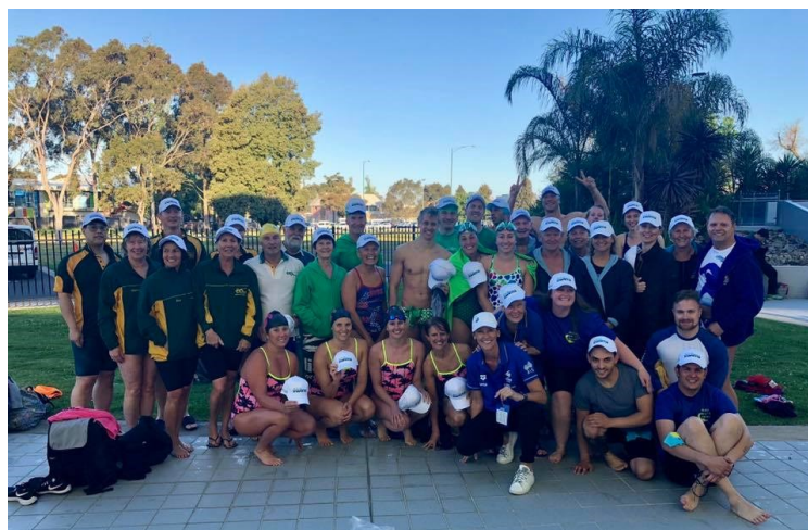
Swimmers from the iSwim Masters Relay Showcase

Was held at MSAC 13 July 2019 202 swimmers from 24 clubs