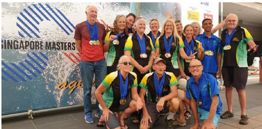
Some of the Darwin Stingers team in Singapore