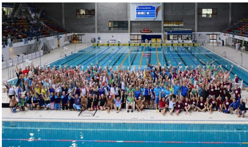
Great Barrier Reef Games