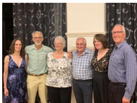
The Organising Committee