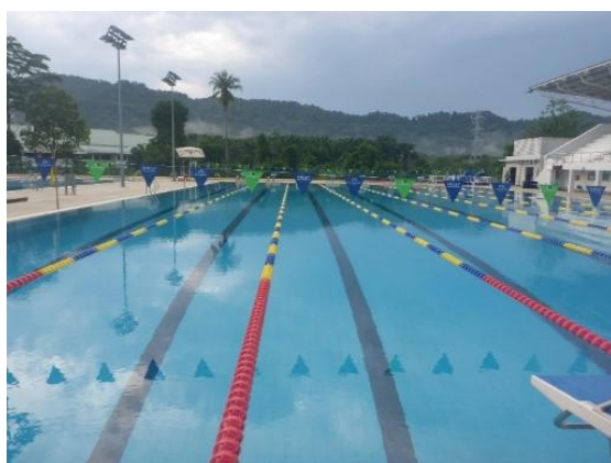
Thanyapura, Thailand (MSA Swim Camp venue)

I propose that the Audited Financial Statements and this accompanying report be accepted as presented.