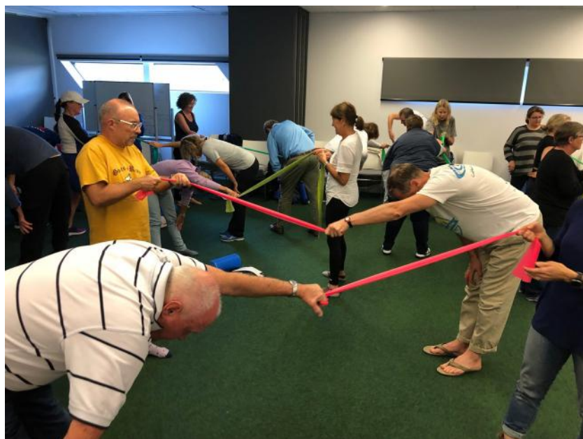
One of the LiveLighter Clinics

Providing development pathways for volunteers and staff has seen several opportunities presented during 2019. The establishment of the Youth Advisory Panel comprising members aged between 18-35 saw excellent ideas generated to attract younger members and encourage volunteering amongst this cohort. The panel also provides for a pathway for members to join the board, which pleasingly has resulted in one member of the Youth Advisory Panel, now nominating for a board position.