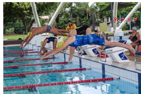
Diving into a MSNT swimming meet

Regular branch meetings were held in Darwin., with a Skype link to the Alice Springs delegate. The AGM was held in Darwin in November.