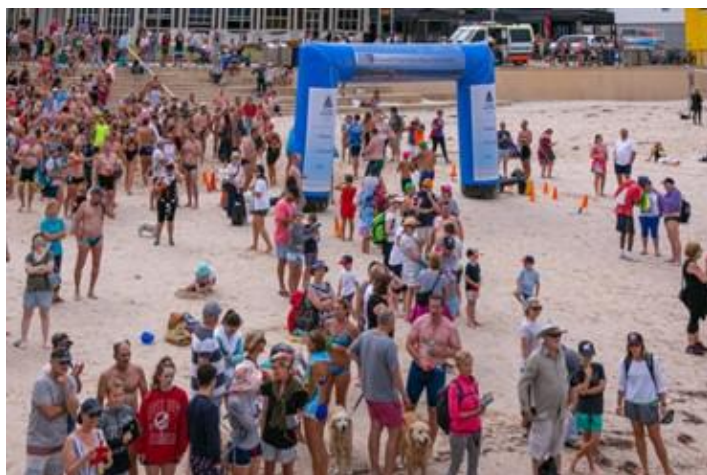
Channel Nine Open Water Swim