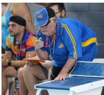
MSNSW Official in action

The first interclub swim meet of 2020 has been conducted by Campbelltown Collegians, sadly the second meet, to be hosted by Myall Masters, was postponed due to torrential weather forecast.