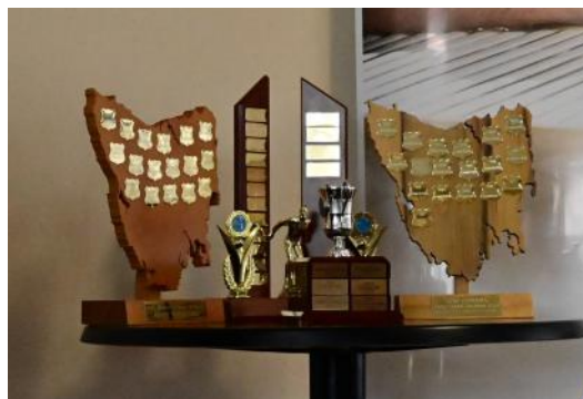
Trophies to be won—MST 2019 Winter Championships

To encourage participation in the Endurance 1000 programme, a 30-minute challenge was conducted in February. By the end of that month there was 95,450 m swum, which increased to 160,150 m by the end of the year, involving 76 swimmers in 110 events. This event will be conducted again in 2020.