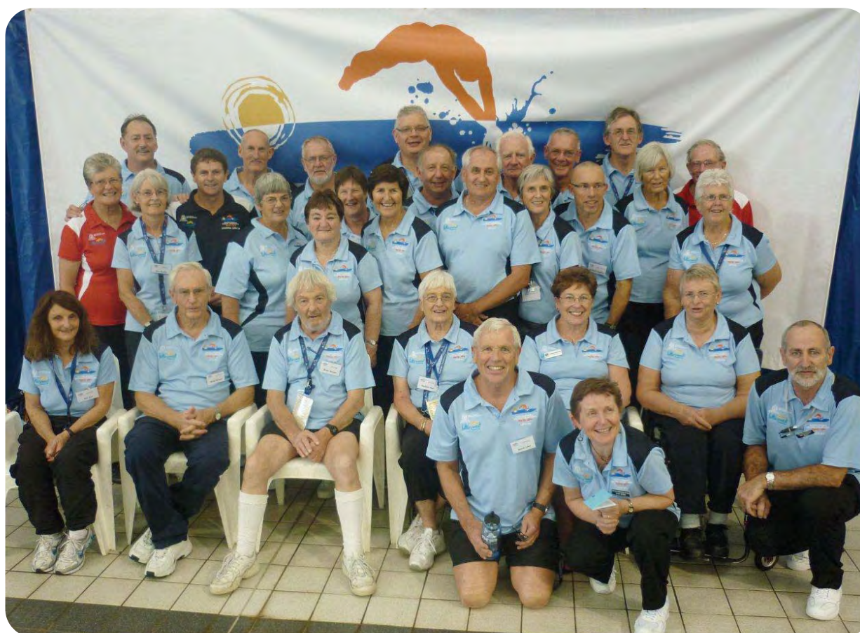
The team of Officials for the National Championships

Sundowner functions were held at the conclusion of swimming on Thursday, Friday and Saturday. These were informal barbecues where swimmers could get-together and socialise after a hard day of competition. The final function was the Presentation Function held at the impressive Royal Perth Yacht Club. Proceedings went smoothly with an excellent buffet lunch followed by the presentation of the many trophies and awards.