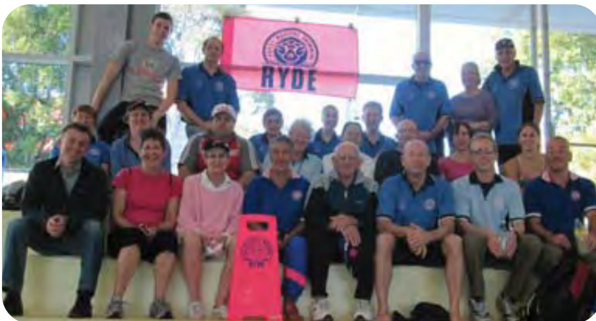
Ryde AUSSI Masters Swimmers

MSNSW extends best wishes for 2012 to all administrators and members of other branches.