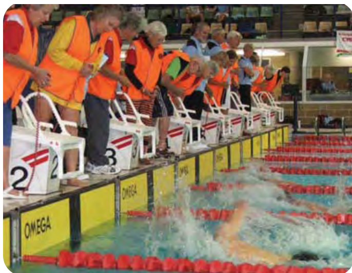
Officials working at the 2011 National Championships