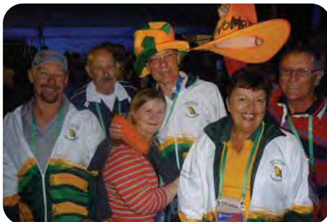
Australian Masters Games officials from the SA Branch