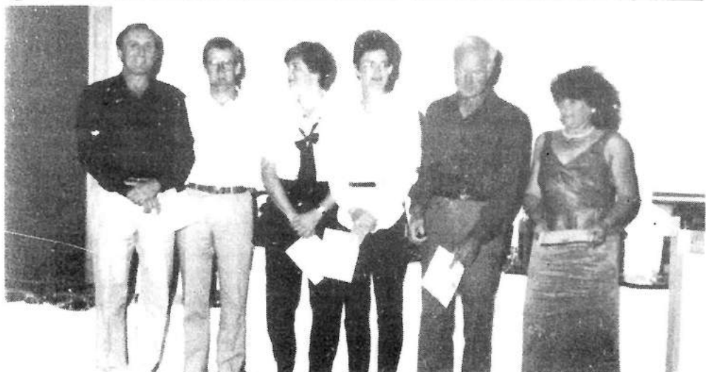
1986 Top Aerobic Scorers.