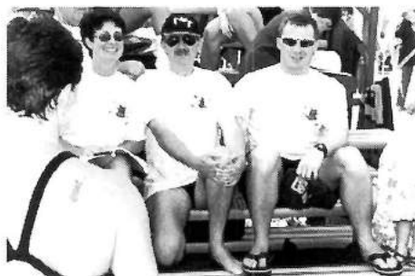
Atlantis was Runner up to the Darwin Stingers