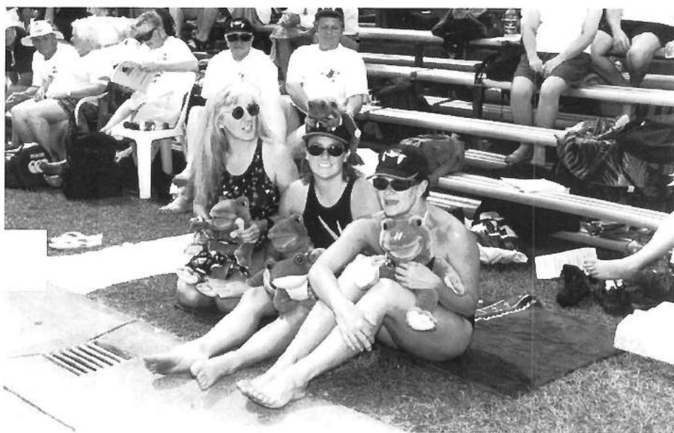
The Atlantis Frogs were there in force