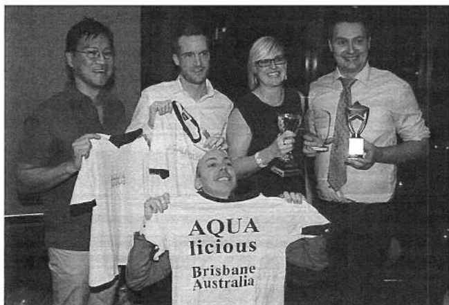
Aqualicious celebrated their 10th birthday

The Autumn and Spring meetings with the National Executive continue to be a valuable opportunity to not only hear about what is going on at the National level but also a chance to meet other State delegates and hear about activities in other branches. Queensland reported on the plans to host the 2014 National Championships in Rockhampton, discussed the release of new branding for Masters Swimming and noted the introduction of a Members Protection Policy.