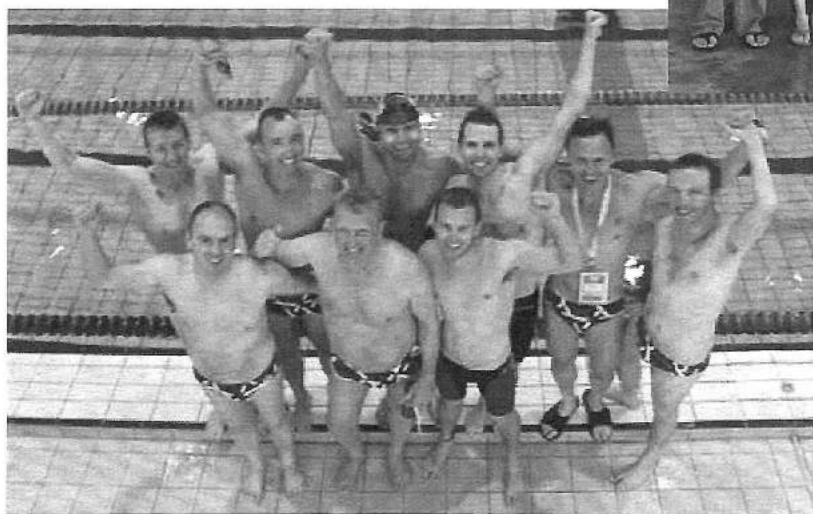
The Glamourhead Sharks brought home 16 medals from the World Out Games in Antwerp in July/August