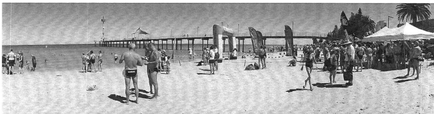
MSSA members at the 1.6km Pub to Pub Swim organized by Atlantis Masters SC