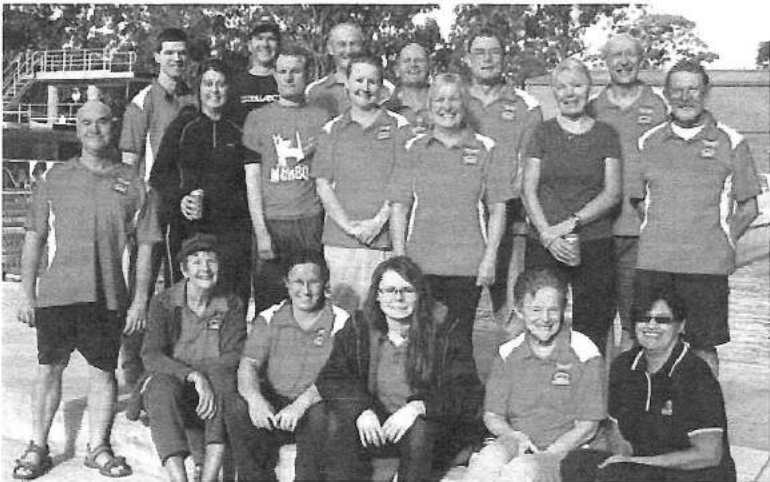
MSQ's Redlands Bayside had 19 members compete for the first time at the Southside Swim Meet in July.

A minor revision of the Guide was undertaken in 2013, with a new edition published in September.