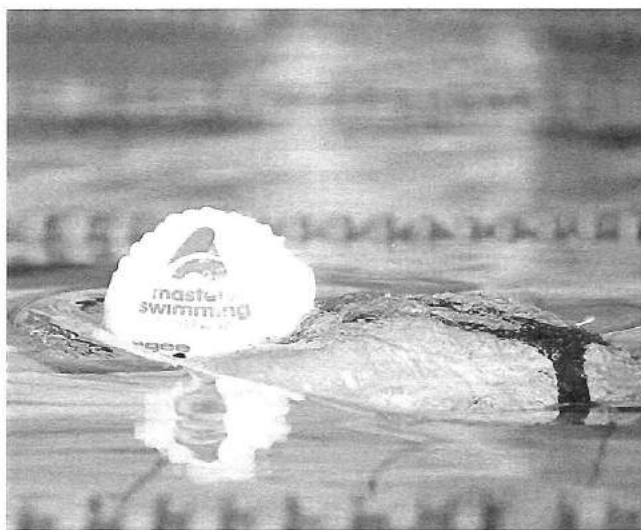
The new MSA and Branch logos were launched in October 2013