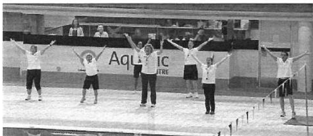
Technical Officials having fun on the pool deck at the 2013 National Championships