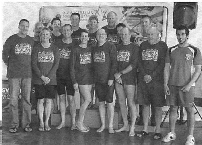
The Boroughcouthas were well represented at the Australian Masters Games held in Geelong in October