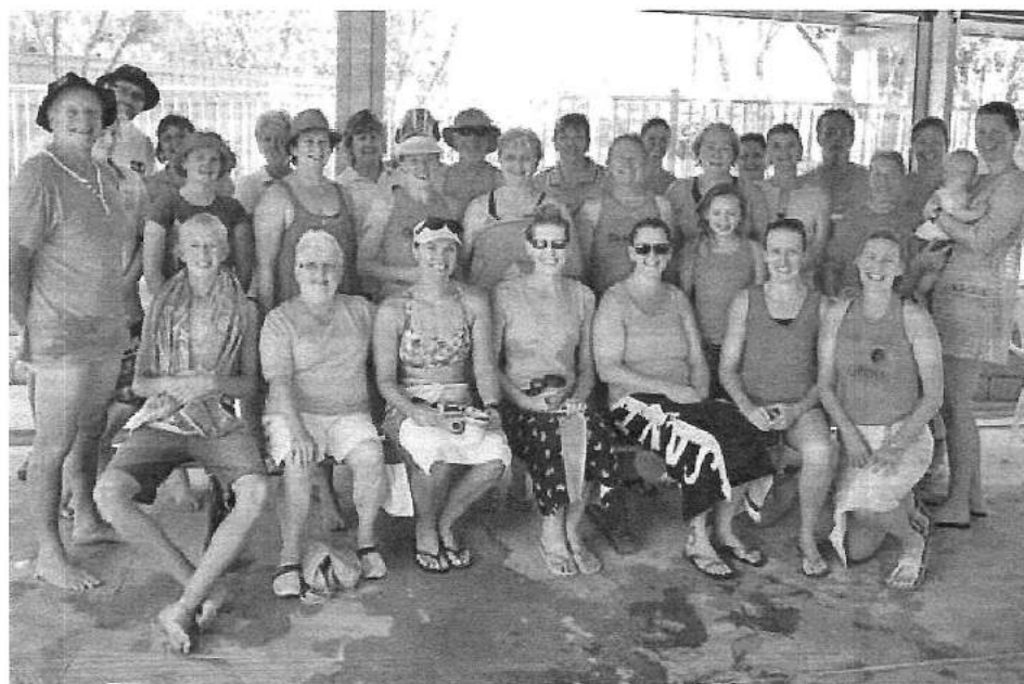
Hervy Bay members swam to raise money and awareness for breast cancer in October.