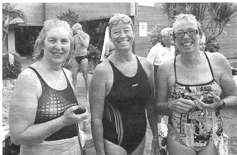
Members at the MSNT Short Course Championships in September