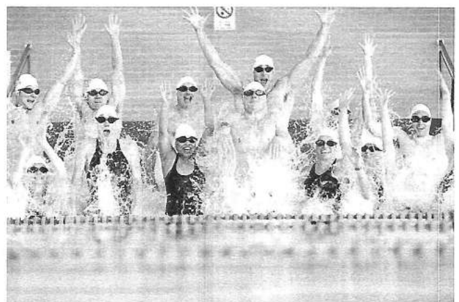
MSA members at the MSA rebranding photo shoot in September