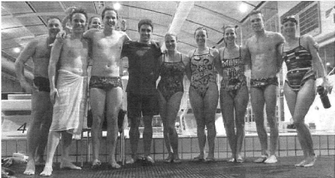
MSV’s Powerpoints welcomed an U.S. Masters Swimming member to a training session in March

*Please Note: Total number does not include 145 second claim members.