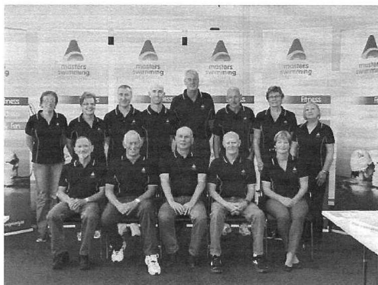
The MSA Board at the October General Meeting with the new MSA and Branch banners