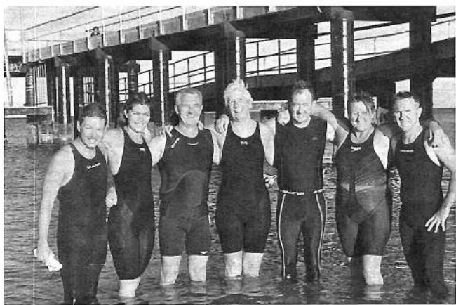
Cockburn Masters Rottnest Channel swim

Four Council of Clubs meetings were held and the AGM conducted in February in conjunction with a Council meeting which included several award presentations - see highlights below.