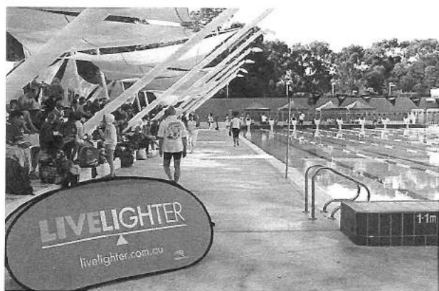
The West Coast Carnival was held in April 2013