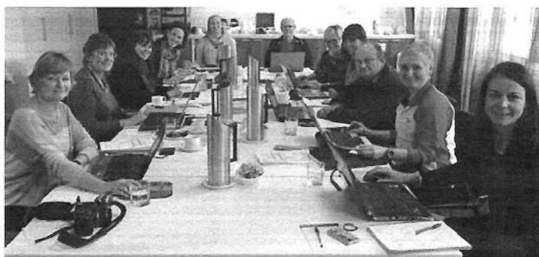
MSA Branch Secretaries/Administrators at the 2013 Administration Workshop in July