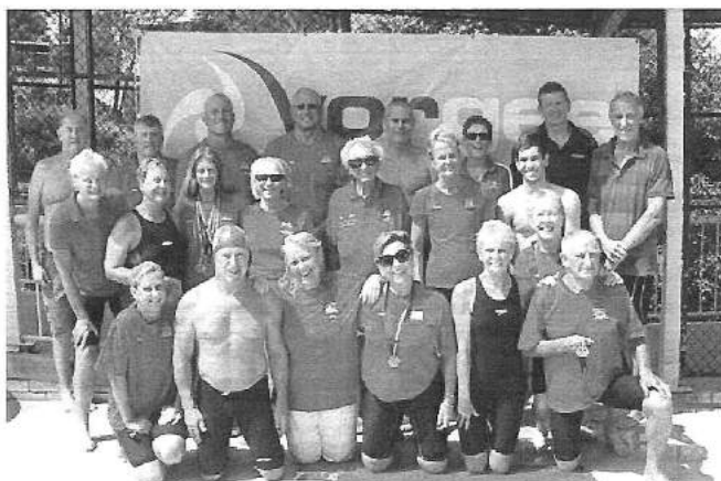
Miami Masters sent a strong team to the MSQ State Short Course Championships in March

Endurance - it is always interesting to see the results of this National program.