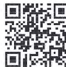
MSA LiveResults QR Code