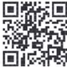
MSA LiveResults QR Code